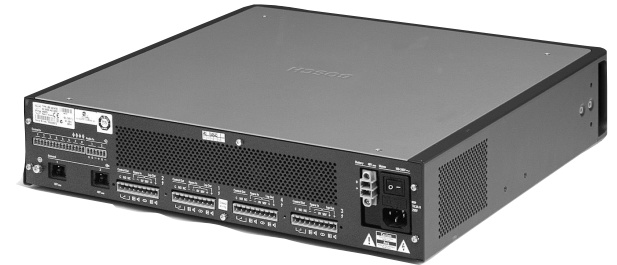
Rear view of LBB 4424/10 Power Amplifier 4 x 125 W