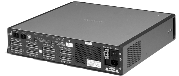
Rear view of LBB 4428/00 Power Amplifier 8 x 60 W