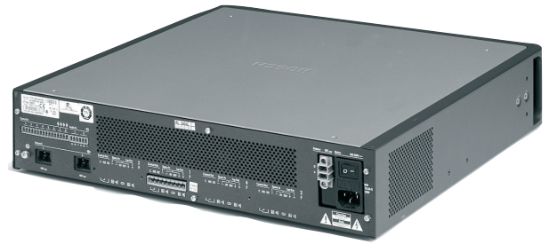
Rear view of LBB 4421/10 Power Amplifier 1 x 500 W