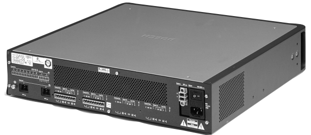
Rear view of LBB 4422/10 Power Amplifier 2 x 250 W