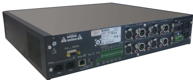
PRS-NCO3 rear view